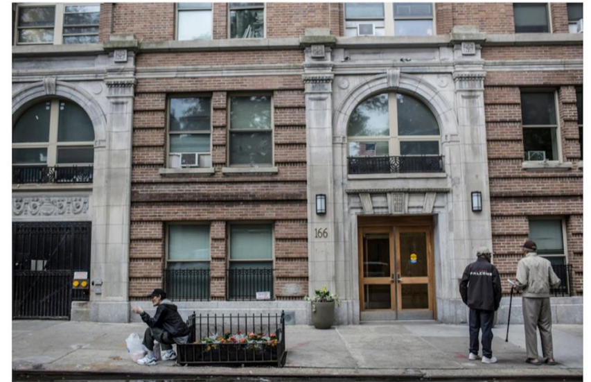
Capitol Hall, a single-room-occupancy residence for decades on West 87th Street, has undergone a top-to-bottom renovation.