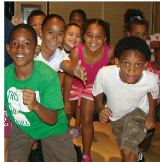
The Center is currently home to an after school program, summer day camp, and community arts.