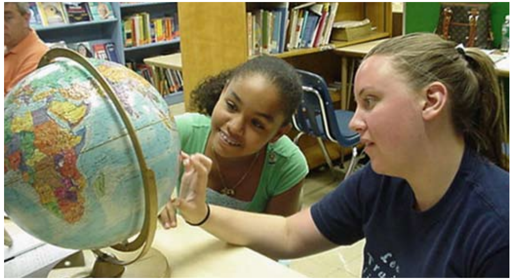
Student with volunteer tutor at SMSTNC's STAR Learning Center.

A quick walk through the West 80s reveals the essential services provided by St. Matthew's and St. Timothy's Neighborhood Center. A kitchen in a church basement on West 86th Street and West End Avenue turns out 500 meals a day for its Meals On Wheels program. One block north, a brownstone, currently under renovation, is home to children from its Head Start pro-