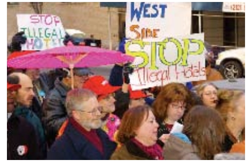
Elected officials attend Law Project Rally in February

Just last month, the Law Project co-sponsored a rally to stop the illegal rental of apartments and rooms to tourists in an